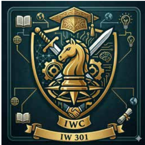
AI generated content.