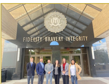
Irregular Warfare Center at the FBI National Academy: On October 16, 2024, the Irregular Warfare Center delivered a Hybrid Threat Awareness lecture to students at the FBI's National Academy. Over 90 local, state, federal and international law enforcement officers were presented with vignettes of current hybrid threats to increase awareness and understanding of irregular activities in the U.S. International participants from Burkina Faso, Canada, Finland, Ireland, Italy, Malaysia, Panama, Poland, Spain, Switzerland, and Ukraine also in attendance received an understanding of how a whole-of-government approach to integrated deterrence can enhance national security.