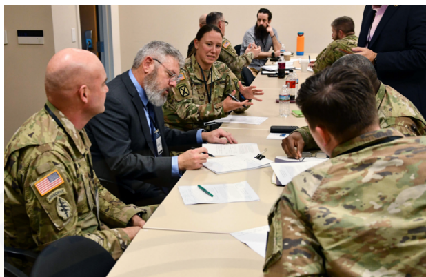
Event participants discussed exercise strategy in breakout groups during the Center's IW Medical Resiliency and Sustainment Working Group event from Jan. 30 - Feb. 2, 2024, at the Henry M. Jackson Foundation for the Advancement of Military Medicine in Bethesda, Md.