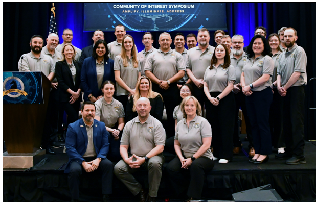
The Irregular Warfare Center (IWC) team at our Irregular Warfare Center Community of Interest Symposium (IWCCOIS) on March 11-13 in Tyson's Corner, Va.