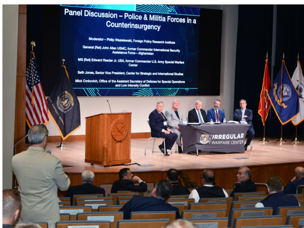
An audience member provides feedback during the Q&A portion of the panel on "Police & Militia Forces in a Counterinsurgency," during the IWC's and FPRI's Center for the Study of Intelligence and Nontraditional Warfare two-day IW Global War on Terrorism lessons learned since 9/11 conference, Sept. 17-18, 2024, at the U.S. Naval Institute's Jack C. Taylor Conference Center in Annapolis, Md.

Through these LOEs, the Irregular Warfare Center addresses current and emerging security concerns and challenges with world-class research, rigorous analysis, top-tier strategic education and training for U.S. and international partners.