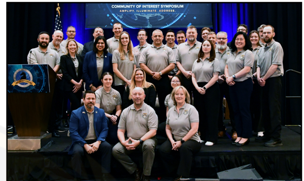
The Irregular Warfare Center (IWC) team at our recent Irregular Warfare Center Community of Interest Symposium (IWCCOIS) March 11-13 in Tyson's Corner, Va.