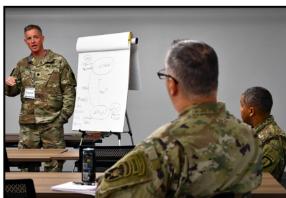
Participants at the Center's IW Medical Resiliency Wargame event discuss a recent scenario update during one of the Day 2 wargame scenarios on Aug. 15 in Bethesda, Md.