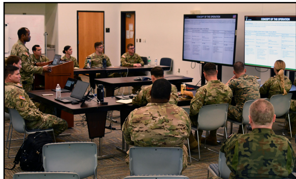
Ridge Runner RR IWX (23-01) participants receive a daily briefing of essential exercise evolutions during the Center's and WVNG's Ridge Runner Distinguished Visitor Day event, June 7, 2023, at Camp Dawson.