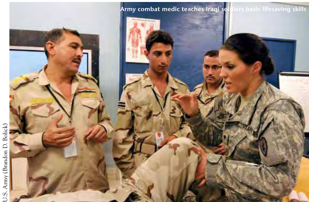
U.S. Army (Brandon D. Bolteck)

moment in U.S. national security policy defined by the influence of soft power in doctrinal and strategic planning. 10 We describe, for instance, the changing nature of operational environments through the eyes of this document; the civilian tasks deemed necessary in new conflict environments; the changing role of the military and its new areas of responsibilities; and emergent practices in the evolution of postconflict reconstruction military paradigms. At the core, we see a major departure from 9/11-era security strategy (in NSS 2002 and NSS 2006, among other documents) in this manual as a function of perspective—a whole-of-government approach informed by both a war-based and a postconflict vantage point. 11 We also see, as a product of this changed perspective, an increasing convergence of mission in U.S. national and international security policy objectives and in interventions more broadly, evident in the 2010 NSS. Most significantly, we frame Stability Operations as a document pervaded by a self-reflective process in which a military institution, in this case the U.S. Army, is in the act of reimagining itself to play a different role in international security and, consequently, adapting to a transforming identity.