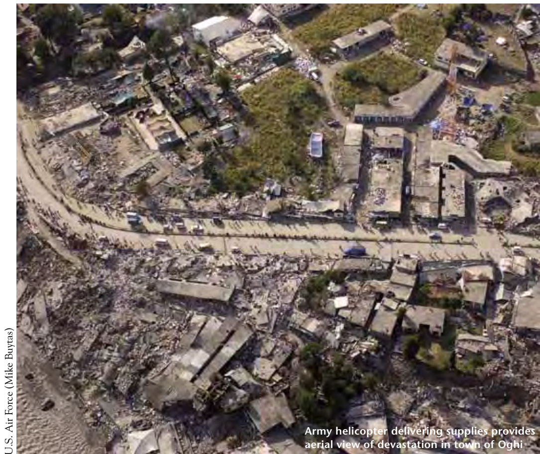
U.S. Air Force (Mike Buytas)