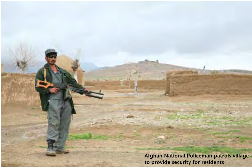
Afghan National Policeman patrols village to provide security for residents

Recognition of the lack of consistent and timely progress that these disparate efforts have shown led to the creation of yet another major command, the NTM–A. 13 This organization, made up of military and police professionals from 19 nations, was designed to facilitate the close cooperation and coordination of all organizations involved with developing the ANP. It supports the development of self-sustaining institutions that will allow the ANP to train and professionally educate security forces to enforce laws and protect Afghans in the future. 14 The key mission of the command in relation to developing the ANP is to establish their institutional training base and grow their force—in quantity and quality.